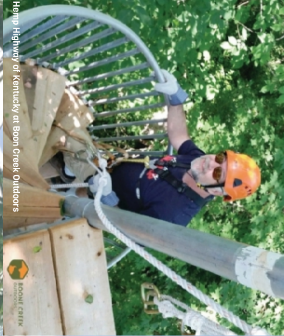
Hemp Highway of Kentucky at Boone Creek Outdoors

The map on the other side of this brochure shows the locations of the 13 roadside markers that make up the skeleton of the Hemp Highway of Kentucky tour. The map also features our kind sponsors, whose gracious support make this enhanced brochure possible.