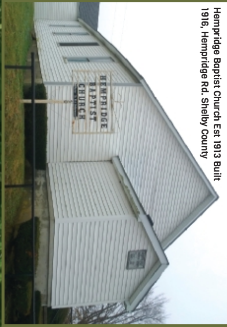
Hemphridge Baptist Church Est. 1913 Built 1916, Hemphridge Rd. Shelby County

Disclaimer: The Hemp Highway of Kentucky is a self-guided tour of Kentucky's fertile hemp history. We do not promote or condone any activity that is illegal in the Commonwealth of Kentucky.