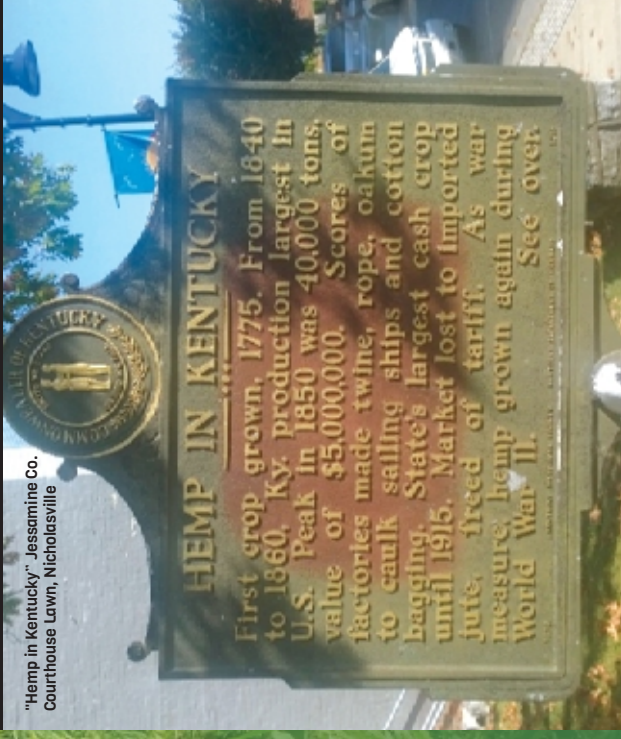
"Hemp in Kentucky", Jessamine Co. Courthouse Lawn, Nicholasville