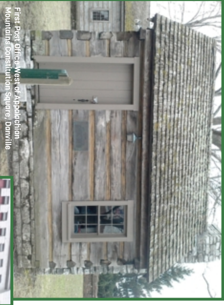
First Post Office, West of Appalachia in the Mountains Construction Square, Danville

After a day of taking in the sites treat yourself to a craft beer and artisan pizza at the Bluegrass Pizza Pub on W. Main St. Just look for the red building with the rope motif window moldings.