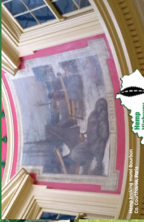
Hemp-braking mural, Bourbon Co., Courthouse, Paris