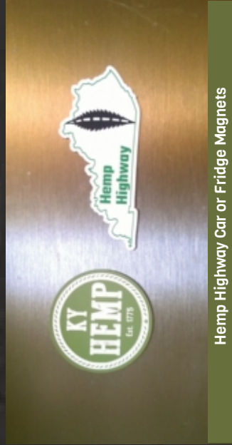
Hemp Highway Car or Fridge Magnets

On your way into town please visit the Full Circle Market to stock up on a variety of wholesome organic snacks and other products. While there ask for a taste of their homemade beer cheese a healthier twist on a local delicacy. You can also get your Hemp Highway gear like T-Shirts and magnets.