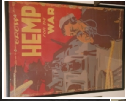
Photo to Right: Original Hemp for Victory Sign Bluegrass Heritage Museum

Winchester was the site of Kentucky's only Hemp for Victory era hemp mill. It was recently torn down, but you can still learn about it at the Bluegrass Heritage Museum 217 S. Main St.